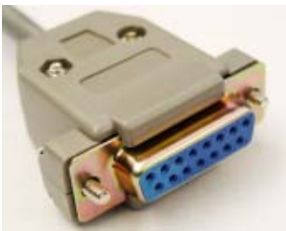
With plastic cover