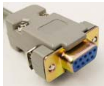
With plastic cover

For questions or additional information, contact Dave Jones Design at the phone number or addresses shown at the top of page one.