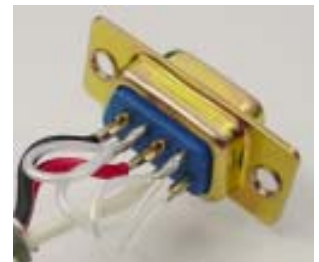
View from below